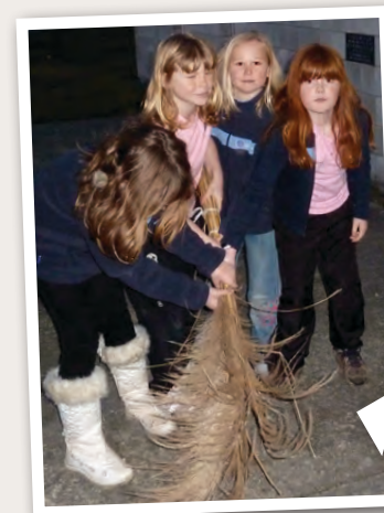
Here are the Riversdale Brownies with a broom they made from toi toi.

Weave the thin strands of fibre together into a bundle and tie them with a piece of bush rope – then you have a broom!