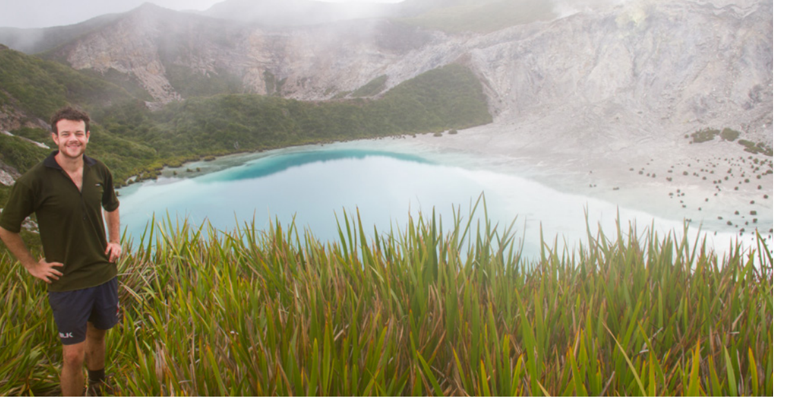
Matt on assignment